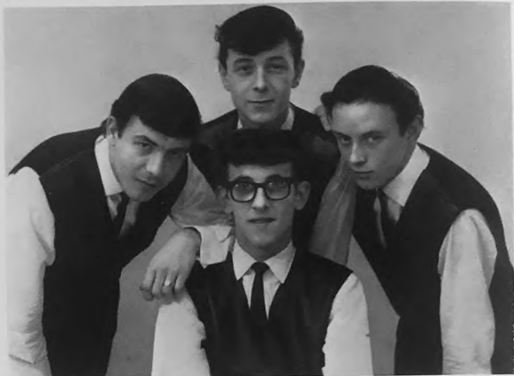
THE LE ROYS

I played the six tracks to four well-known musicians, all in top groups, who voted the single (as it is called) fab value for only 6/8 for six tracks.