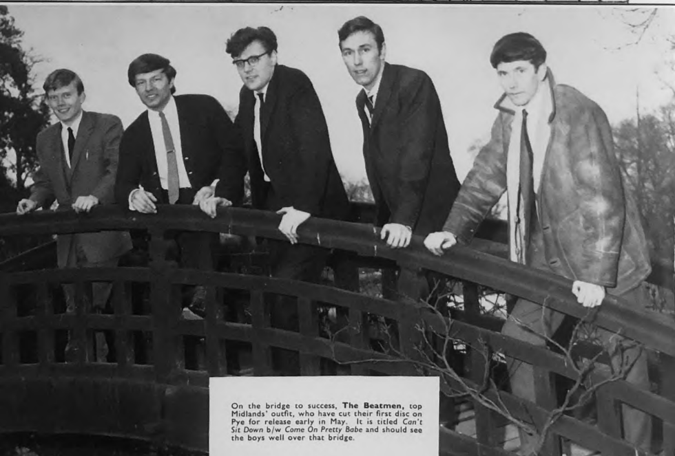
On the bridge to success, The Beatmen , top Midlands' outfit, who have cut their first disc on Pye for release early in May. It is titled Can't Sit Down b/w Come On Pretty Babe and should see the boys well over that bridge.